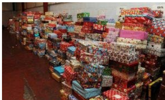
Shoebboxes collected for Team Hope

The children all did very well bringing in the Shoeboxes for Team Hope. A total of 295 boxes were collected and will go directly to needy families in Africa and Eastern Europe, many of whom are living on less than €1 a day so a big thank you and well done to everyone who supported Team Hope.