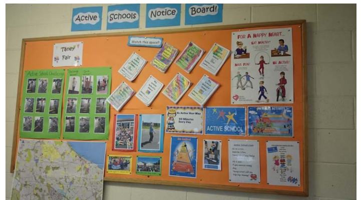
Active School Notice Board