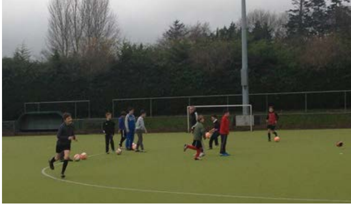
Senior Boys Soccer

Senior boys' soccer has 62 boys taking part this year. The boys all really enjoy both the training and the matches. The players have been split into four teams and are currently playing friendly matches to determine which leagues they will be put into after Christmas.