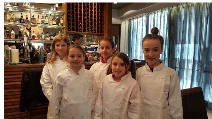
Winners in China Sichuan Sandyford