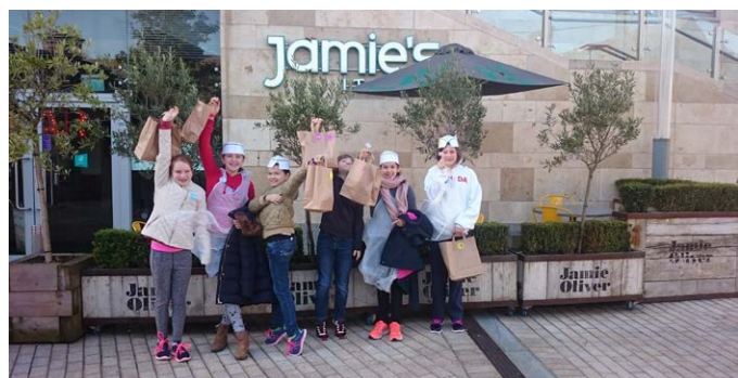
Winners in Jamie's Dundrum.

Our winners were treated to a behind-the-scenes restaurant experience, very kindly facilitated by China Sichuan (Sandyford), Jamie's Italian and Wagamamas in Dundrum. They prepared their own food, inputted orders through the system, served customers and learned about healthy eating. All-in-all, a wonderful experience! We would like to thank the restaurants for being so obliging and for giving our winners such an exclusive prize.