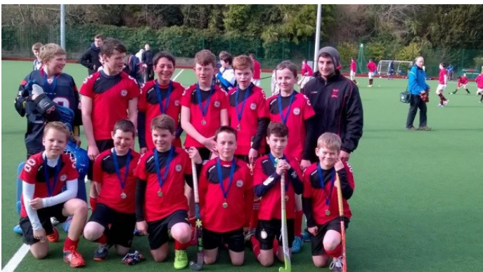
A Team getting silver medals at the u13 B League final

The boys' 11-a-side team have had a superb season so far, competing against 1st Year secondary schools in an U13 League and Cup. They were runners-up in the B League Final, losing to St. Andrews. They reached the semi-final of the Cup and, unfortunately, were beaten by The Kings Hospital. They also competed in an 8-a-side primary school League and Shield. They have done exceptionally well, winning their League and due to play in the Shield final in TRR on Thursday 26th March.